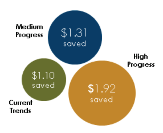
Figure 3. Healthcare savings per dollar spent on family planning in Amhara, 2020

Finally, ImpactNow estimates the healthcare savings per dollar spent on family planning (see Figure 3). Currently, every US$1 spent on family planning saves US$1.10 in direct healthcare costs in Amhara. The medium progress scenario shows that every US$1 spent on family planning saves US$1.31, and the high progress scenario demonstrates that shifting the method mix toward long-acting methods can increase these savings to US$1.92 per dollar spent.