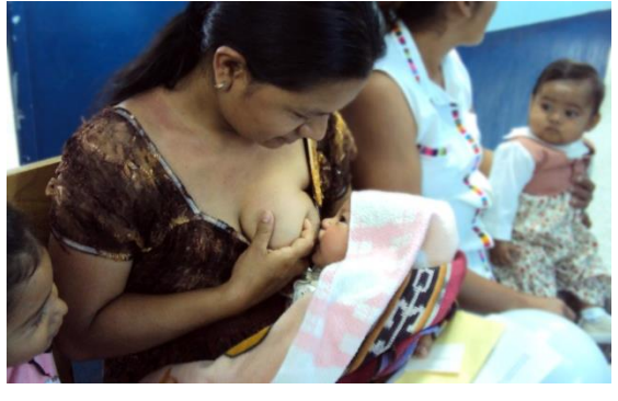
Breastfeeding is fundamental to prevent malnourishment and diseases.