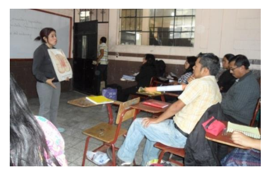
The training workshops were held in coordination with the Municipal Health Commission, the Education Sub-commission and the Health Direction of Quetzaltenango.