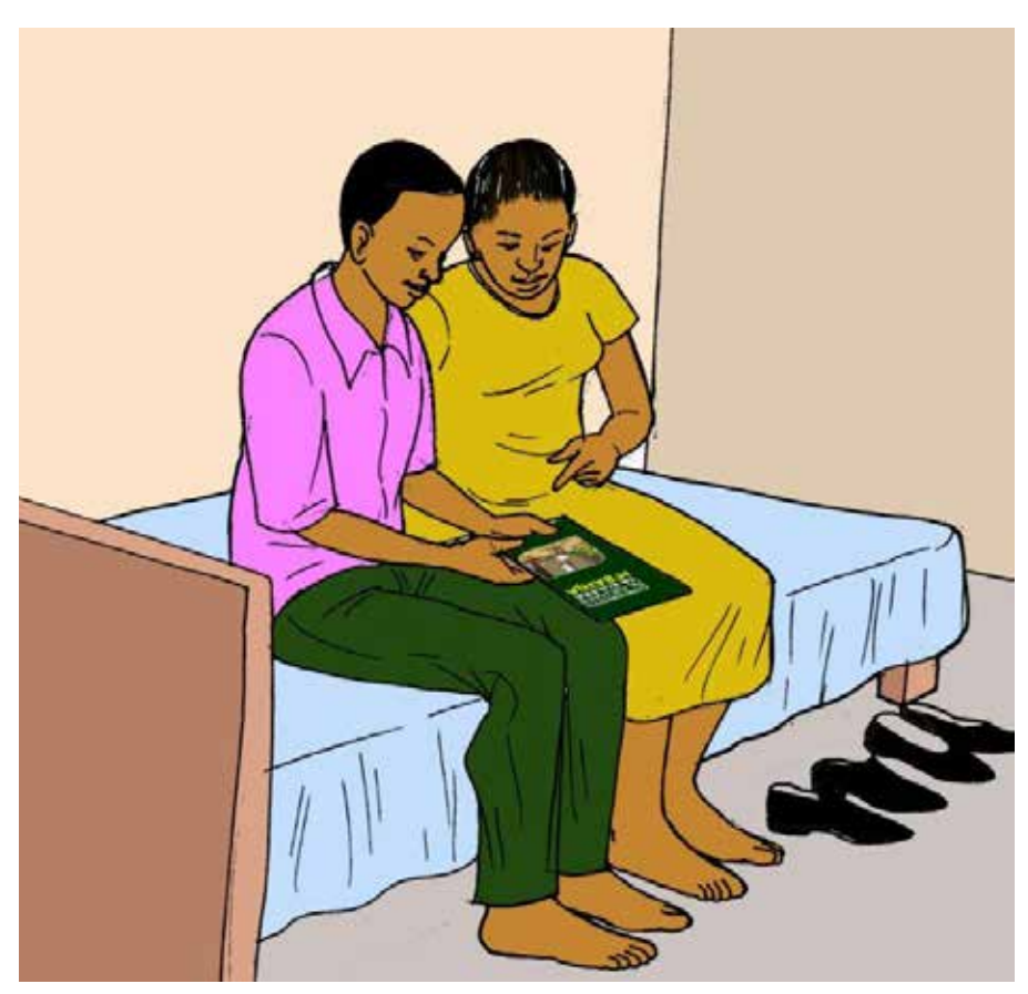
Loving couple talking about planning their family.