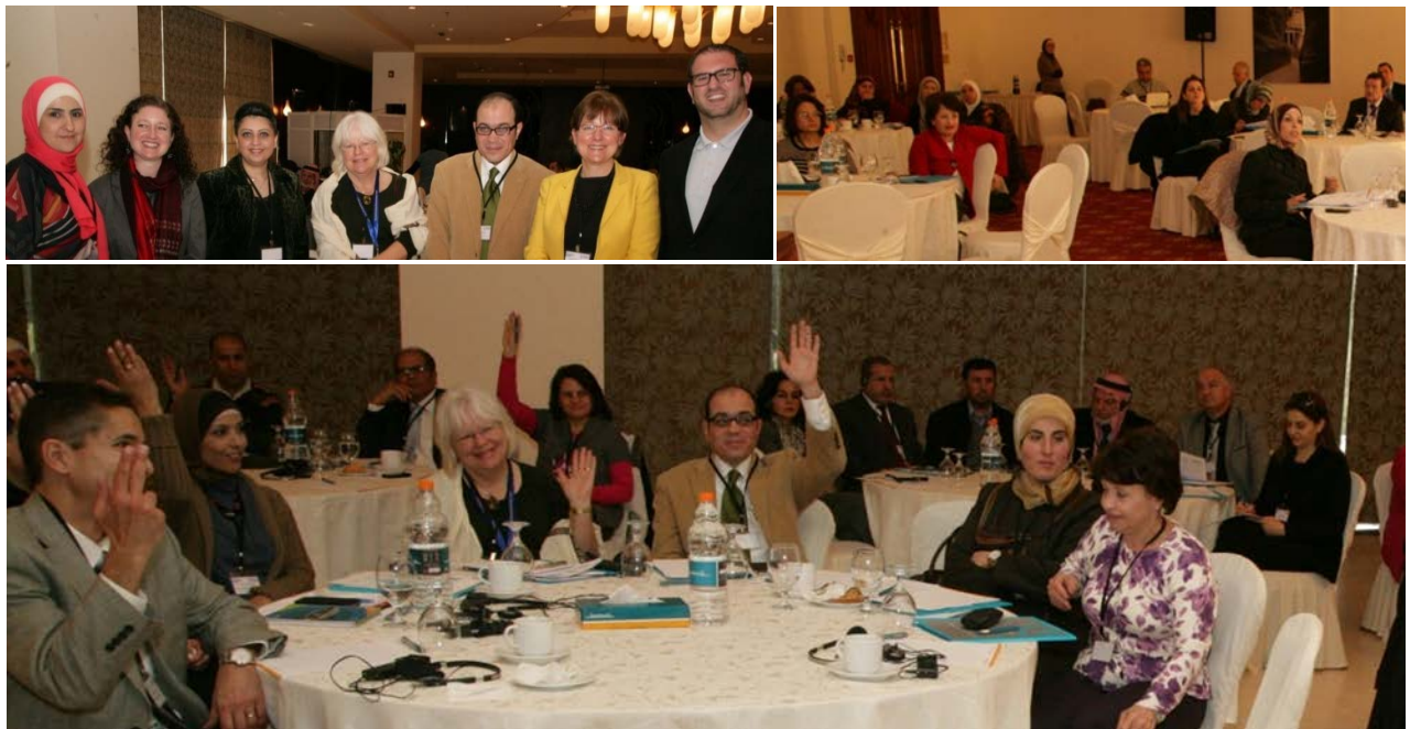
Fifty participants attended the workshop

The 50 workshop participants represented a range of public and private sector organizations, nongovernmental organizations (NGOs), donors, and cooperating agency projects. A list of participants is provided in Annex 2.