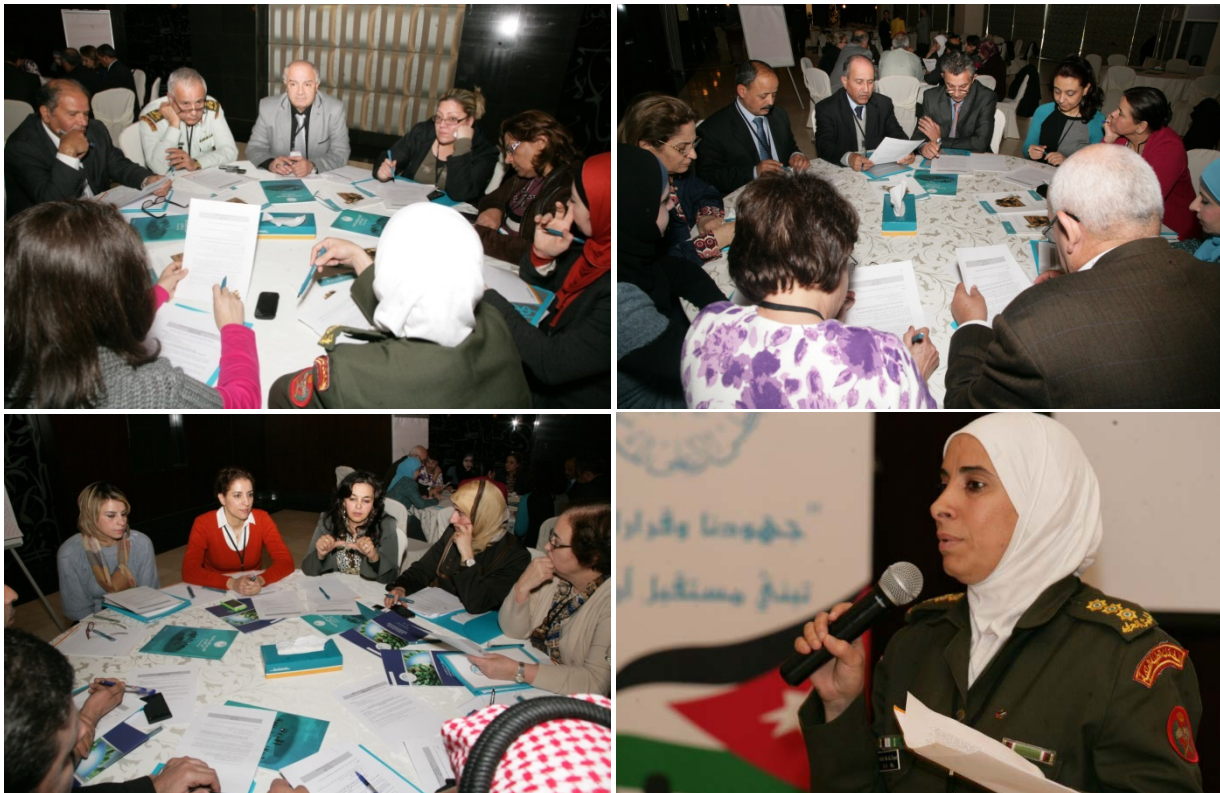
On Day 1 participants formed working groups and provided feedback on their discussion